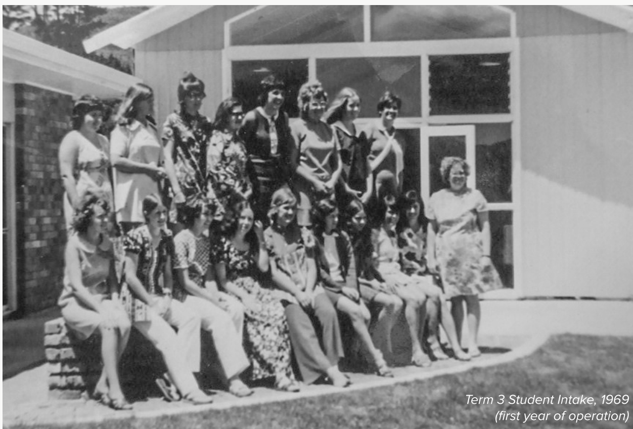
Term 3 Student Intake, 1969 (first year of operation)